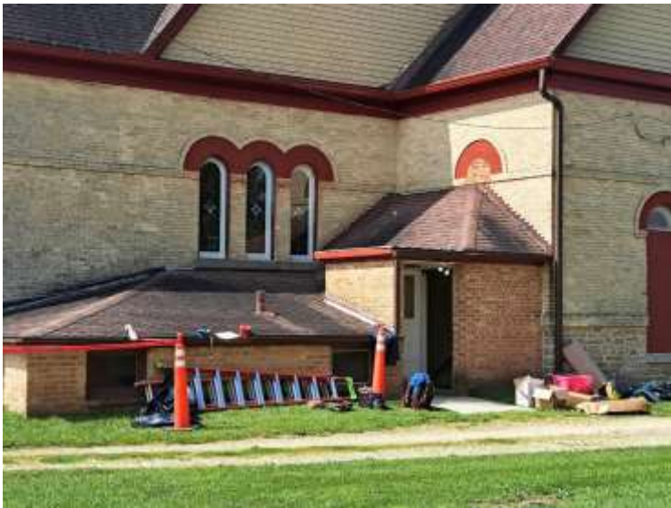
Barrier free construction has started on the Upper Church!